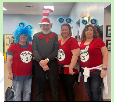
A visit from the Cat in the Hat!