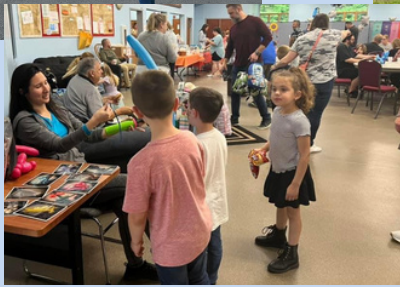
Pre-K field trip to Wegmeyer Farms