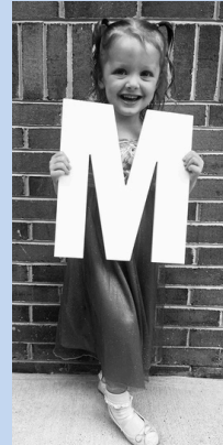
The Hummingbirds' Mother's Day pictures